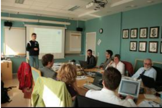
Figure 2 Workshop at Sintef, Trondheim