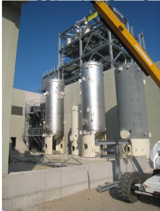
Bioliq pyrolysis pilot plant at KIT