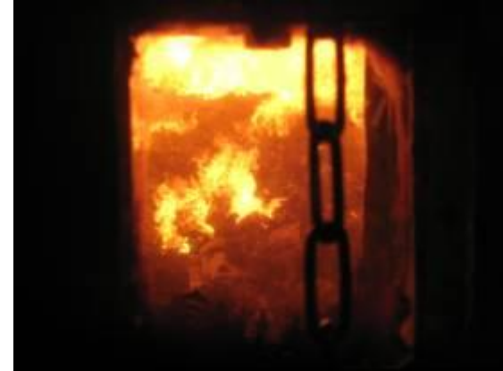
Grate incineration at MVV energy from waste plant, Mannheim, Germany.