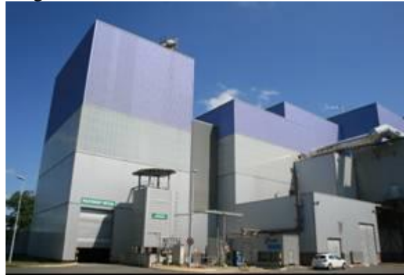
Lasse incineration plant (100,000t/y) near Angers, France