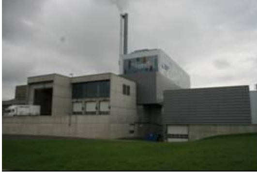
Trondheim incinerator, Norway , which is an important part of the city's district heating system.