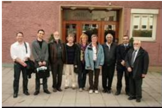
Figure 1: Task 36 participants 2010-2012

This report summarises the work and results of the Task over the 2010-2012 Triennium, evaluating the work carried out and the significance of the findings.