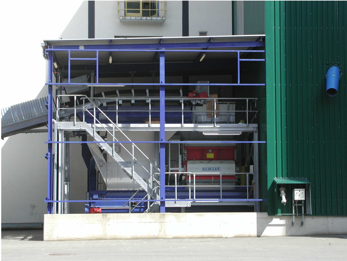
Figure 3. Fuel Preparation at Zeltweg Plant